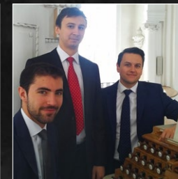
Royal Academy of Music