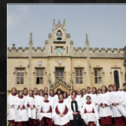
Choir of Sidney Sussex College Cambridge